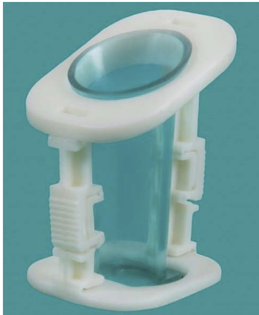
Figure 1. Components of the Alisklamp.