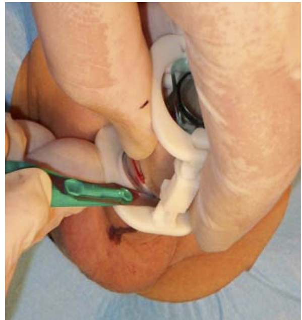
Figure 2. The foreskin squeezed between the inner tube and the outer ring is excised.

primary health care center that did not have a standard operating room.